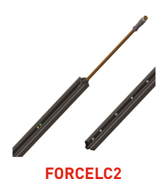
Light curtain, class 2, h=2520mm