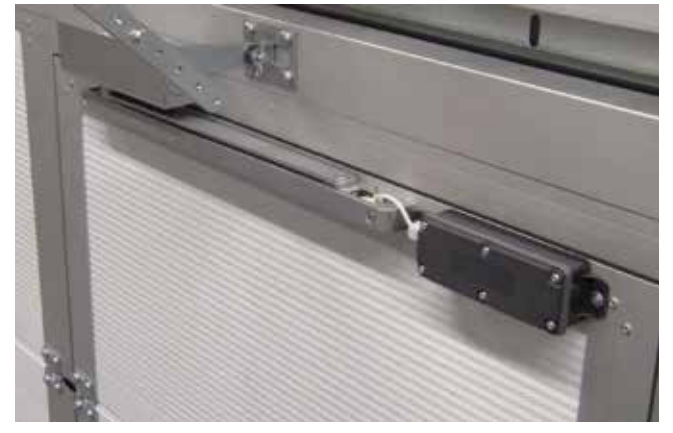
Pass door safety switch