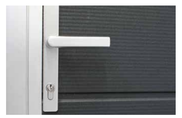
Locks and grips

Find additional information, prices, manuals, movies on all variations, accessories and options for SAFESTEP on: